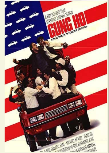
Film poster of 1986 movie Gung Ho!

increased sales. Ford and GM are reporting record sales gains of up to 39% and 25% respectively. Financial incentives such as "Cash for Clunkers" and reduced financing have consumers flocking to the car lots. In addition, the demand might shift outward due to changes in consumer preferences. Many other foreign car companies are experiencing the same sales in-